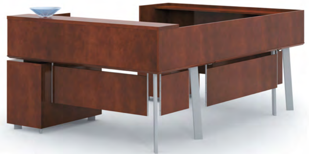
single pedestal desk task unit, extension top task unit and reception station