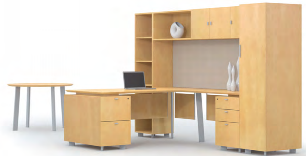
desks and credenzas, l-units with storage